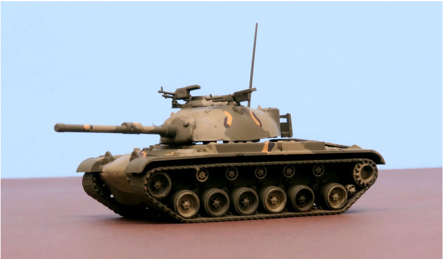
Frank Moore's 1:87 (HO) scale M48A5 Patton Main Battle Tank, converted from a Roco M60 kit. Paints are Tamiya acrylics. The M48A5 was a mid-1970s modification of the Vietnam era M48A3 to carry a larger, 105 mm gun. In American service, the vast majority of M48A5s were assigned to National Guard and Army Reserve Units.