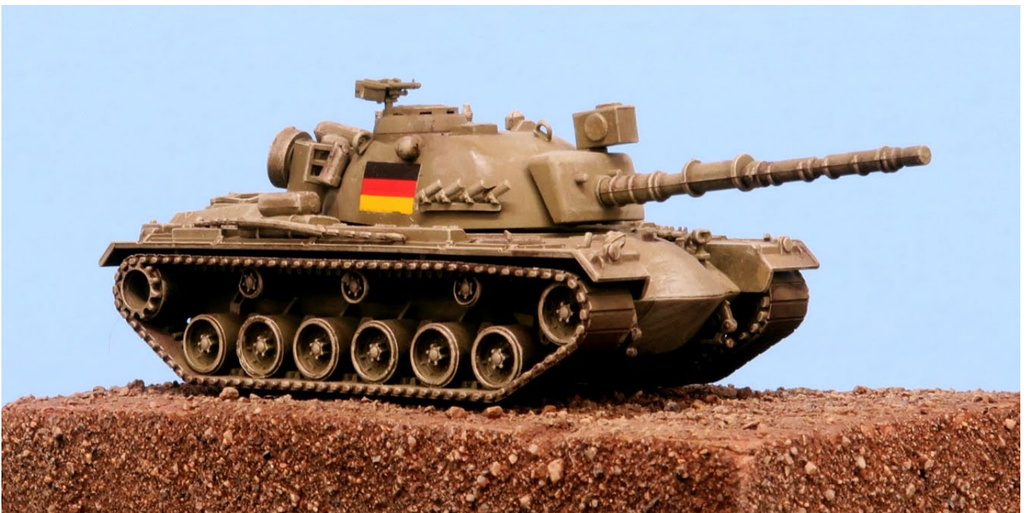
Frank Moore's 1:87 (HO) scale Kampfpanzer M48A2GA2 (Roco), built OOB and painted with acrylics. Markings, from the spares box, are for the West German Bundeswehr in the late 1970s. Along with other NATO allies, West Germany operated versions of the M48A2 starting in the 1950s. The M48A2GA2 was an upgraded version with the 105 mm L7 cannon and a different MG3 installation from the Leopard 1 as well as quite a few other modifications, the most prominent being its commander cupola and its gun mantlet. 650 were converted by Wegmann (Kassel) between June 1978 and November 1980.