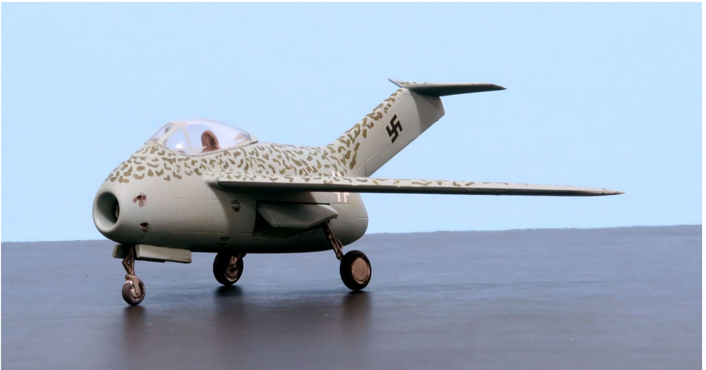
Frank Moore's 1:72 scale Focke-Wulf Ta 183 Hucklebein, built OOB and painted with Tamiya acrylics. Decals are from the kit. The Hucklebein (the name refers to a troublesome raven, Hans Hucklebein der Unglücksrabe , from an illustrated story in 1867 by Wilhelm Busch) was a design for a jet-powered fighter aircraft intended as the successor to the Messerschmitt Me 262. It was developed only to the extent of wind tunnel models when the war ended, but the basic design was further developed postwar in Argentina as the FMA IAe 33 Pulqui II.